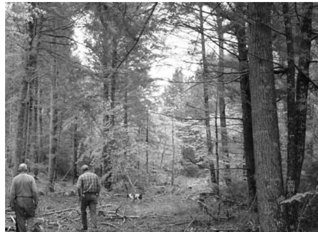
Board members inspect our 2008 winter harvest area

Support the Wabassus Lake Project! Help DLLT protect another 6,644 acres and 9 miles of lakefront from development and loss of public access.