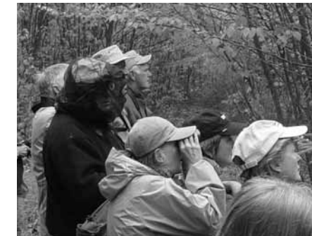
Watching a black-throated blue warbler on the new Pocumcus Lake Trail

DLLT led a hike for the Downeast Spring Birding Festival on the Pocumcus Lake Trail over Memorial Day weekend. Seventeen participants enjoyed the area and saw a variety of warblers and other songbirds.