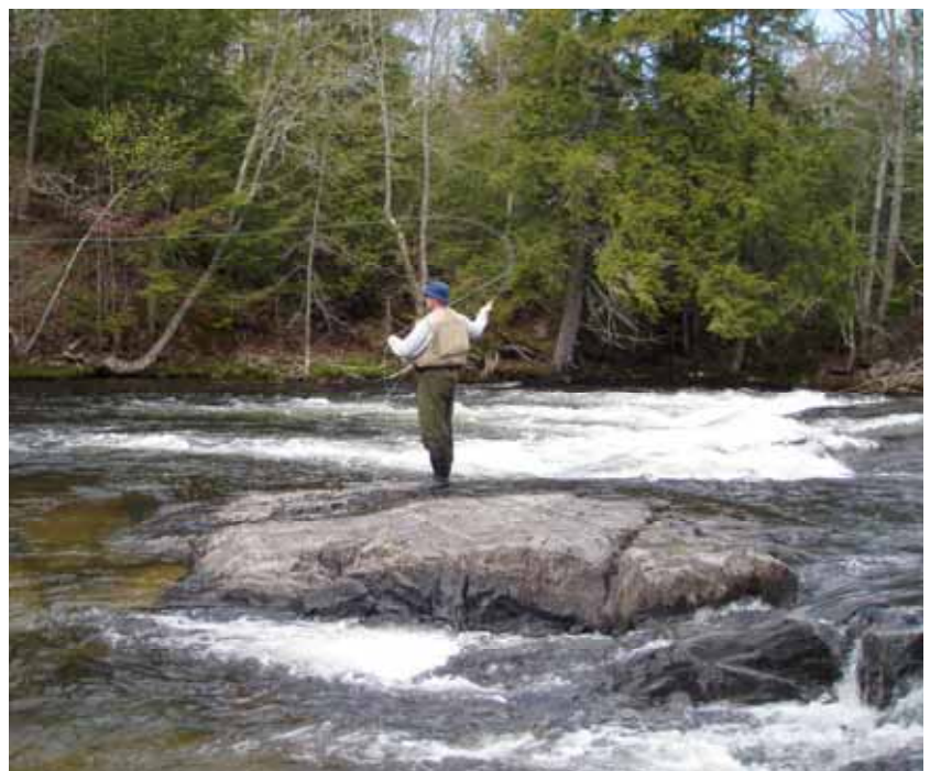
Fishing for landlocked salmon at Big Falls, Grand Lake Stream.

For more information on the project, which will conserve 17 miles of shoreline on West Grand, Lower Oxbrook, and Big Lakes, 3,000 acres of wetlands, including those along 9 miles of Big Musquash Stream, Amazon Mountain and the Pineo Mountains, 42 miles of interior streams, and deer wintering yards, please visit our web site or give us a call. This is a keystone parcel in the center of 1.4 million acres of contiguous international conservation lands.