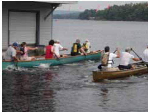
War canoes leave the starting line in the 5th Annual West Grand Lake Race.

Ten minutes later, competitors in the six mile race around Kole Kill Island set out, followed after another 10 minutes by boats opting for the four mile paddle around Munson Island. Then it was time