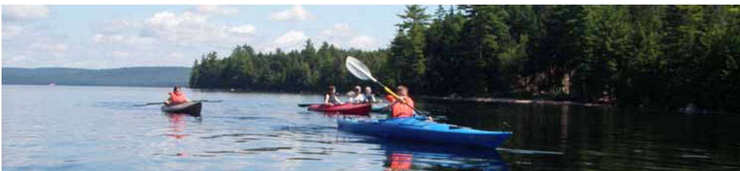
Your support helped DLLT volunteers lead this kayaking trip on West Grand Lake