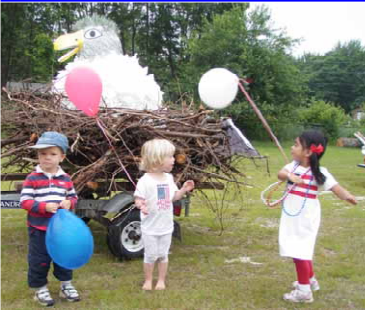
Participants from DLLT's 4th of July float enjoy the festivities.

We appreciate your consideration, and future generations will benefit from your foresight. Thank you!