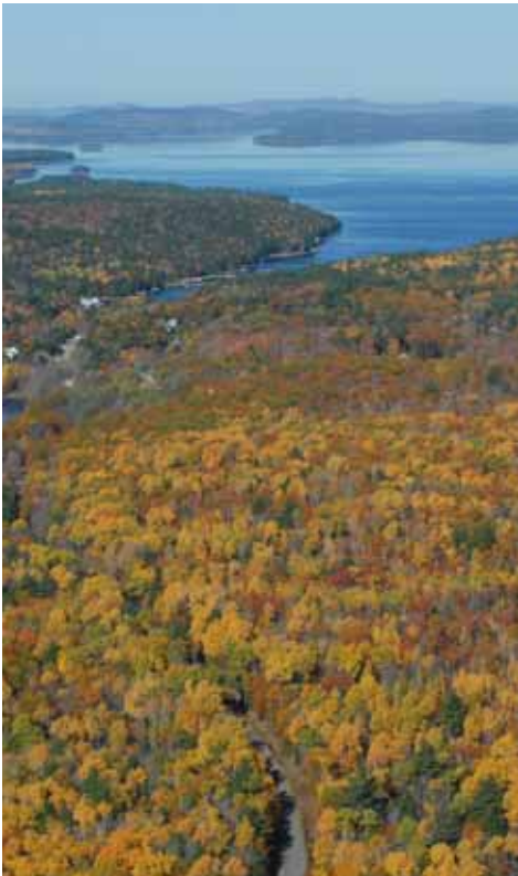
West Grand Lake and the village of Grand Lake Stream, Maine