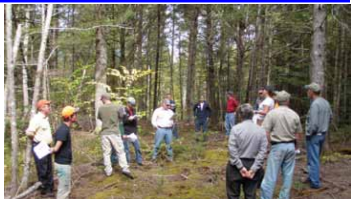
Downeast Forest Managers Tour in a DLLT harvest.

The tour highlighted coordinated wildlife habitat management across the DLLT - BPL boundary. BPL will host the 2nd annual Downeast Forest Managers Tour in 2010.